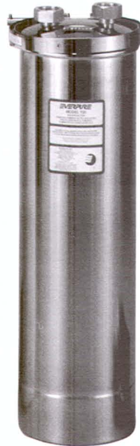
T20 Water Filter: 9370-00 2053 MICRO-PURE Charge: 9690-00 2055 Element & MICRO-PURE Charge: 9710-00